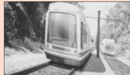
Bottom, "Off street running trolley on existing CSXT RR" between Mass. Ave. and Howard St. is a possibility.