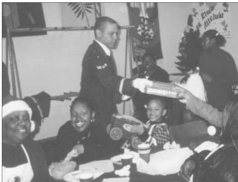
Christmas Party At St. Matthews