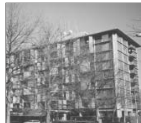
Twin Tower, 101 G St. S.W.