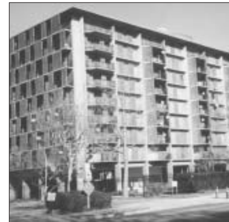
Capital Park Towers, 201 I St. S.W.

Fannie Mae - nickname for the Federal National Mortgage Association - has a $2 trillion goal to increase the supply of affordable rental housing and homeownership to serve 18 million American families by the end of this decade.