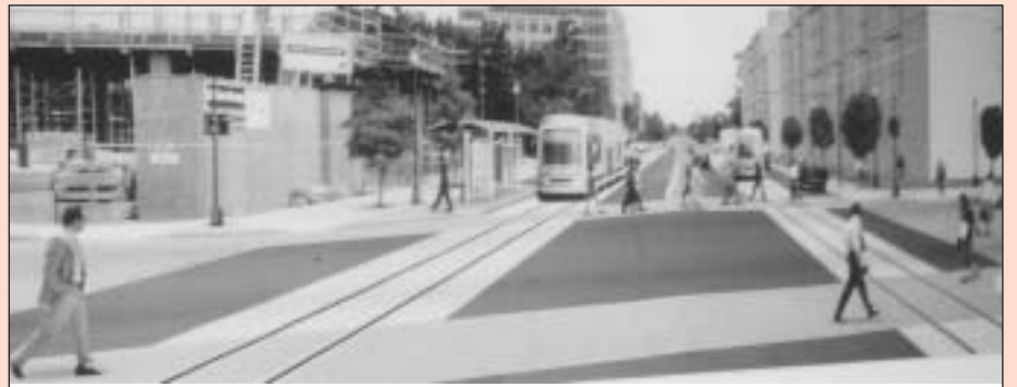
Above, "Curbside running trolley station stop at M Street and Navy Yard Metrorail station," was displayed at So. Capitol St. Gateway meeting in Dec.

Light refreshments and limited child assistance will be provided.