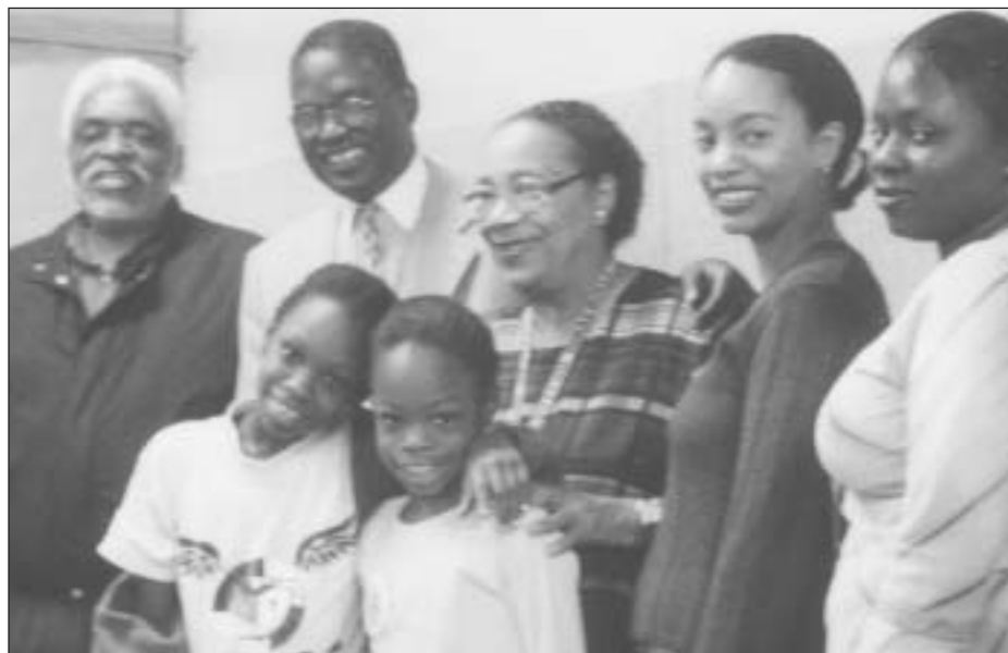
SAT Practice At S.E. University