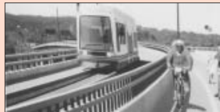
Middle, "New Trolley Lane Extension with Bike/Walking" on 11th St. bridge, was illustrated at Dec. meeting.