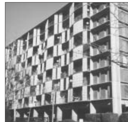
Twin Tower, 103 G St. S.W.