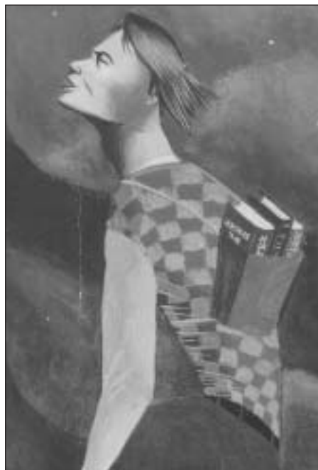
Young Theophilus North starts out on his journey to see the world.

This is a co-production between Arena Stage and Rochester, New York's Geva Theatre. He will be the featured guest at 7 p.m. Monday, January 27 at Molly's Salon, the hour-long discussion program scheduled the Monday near