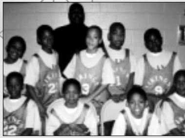
Club #4 BB

Metropolitan Police Boys & Girls Club #4 has several winning basketball teams nearing the end of the season. (Names were not available as The Southwester went to press.)