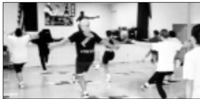
Health through exercise at Jazzercise class.