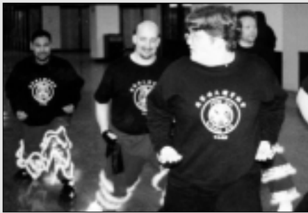
The Chinese Dragon dancers delight children and adults alike at Jenny's Chinese Restaurant.